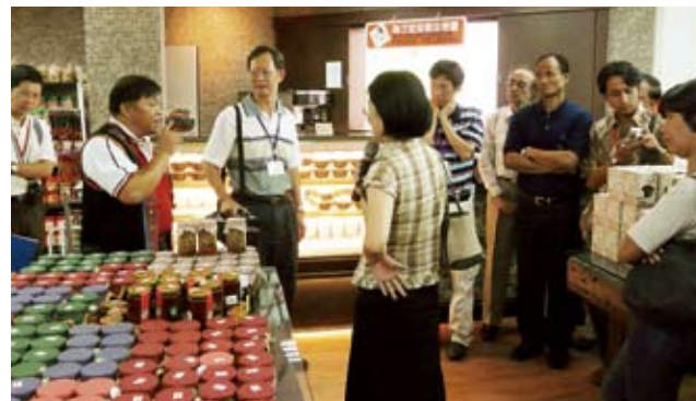
Hsing-Yi Farmer's Association manager (L) explaining food-processing procedures Multicountry Observational Study Mission on Value-adding Technologies for Fruit and Vegetables, ROC, 14–18 July 2008.