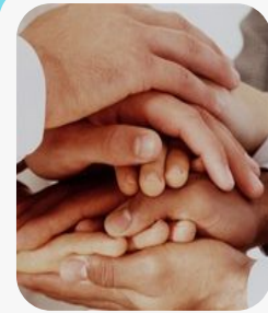
TEAMS Style Working within a team

Well constructed teams produce results and have a flow of energy and ideas that are easy to see.